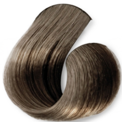
Light Blonde CÓD.1016