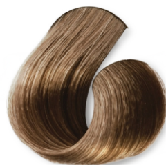
Golden Beige Very Light Blonde CÓD.1032