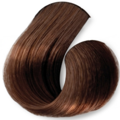
Acajou Brownish Dark Blonde (Intense Cinnamon) CÓD.1022