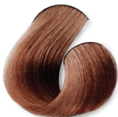
Golden Blonde CÓD.1030