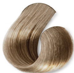
Greyish Beige Very Light Blonde CÓD.1031