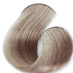
Soft Greyish Irisdescent Extremely Light Blonde CÓD.1043