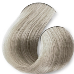
Pearl Ultra Light Blonde (Champagne) CÓD.1037