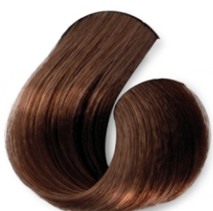
Brownish Light Brown CÓD.1019