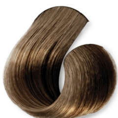
Brownish Dark Blonde (Chocolate) CÓD.1020