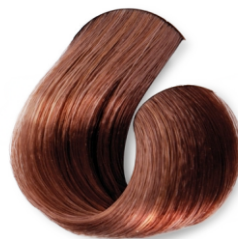
Intense Copper Light Blonde CÓD.1033