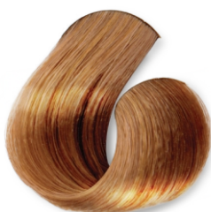
Soft Golden Brown Very Light Blonde CÓD.1042