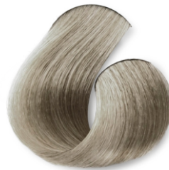
Grey Very Light Blonde CÓD.1027