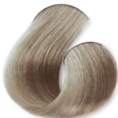
Pearl Very Light Blonde CÓD.1036