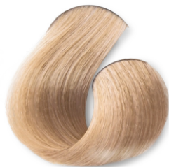
Very Light Blonde CÓD.1017