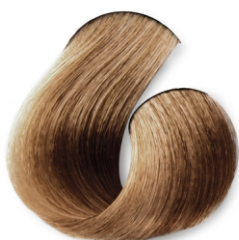
Soft Golden Beige Very Light Blonde CÓD.1041