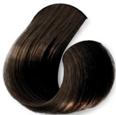
Dark Brown CÓD.1011